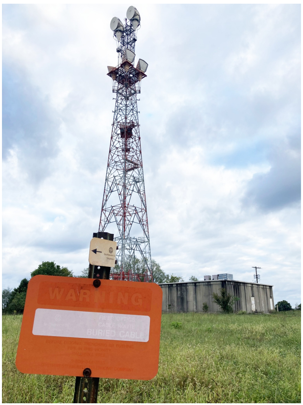
Looking at the site from the northwest at Beacon Lane and Beacon Road. In the foreground is a Southwestern Bell cable marker at the northwestern corner of the site.